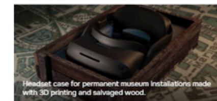
Headset case for permanent museum installations made with 3D printing and salvaged wood.