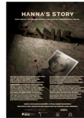
Poster for events, gallery exhibitions and museum installations

The experience was then brought to museums across Europe and the US, where it deeply affected and informed viewers of the once hidden courage and bravery in a time of unimaginable terror.