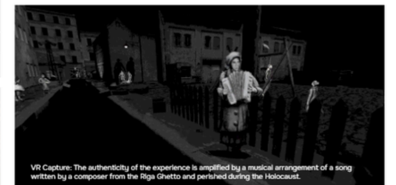
VR Capture: The authenticity of the experience is amplified by a musical arrangement of a song written by a composer from the Riga Ghetto and perished during the Holocaust.