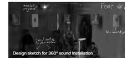
Design sketch for 360° sound installation