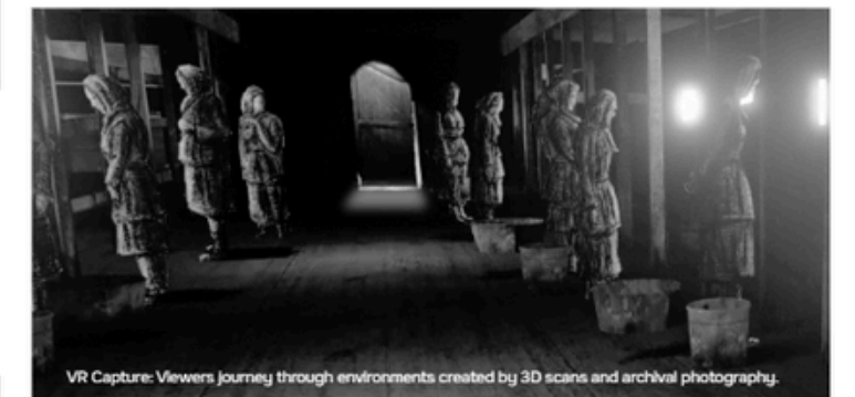
VR Capture: Viewers journey through environments created by 3D scans and archival photography.