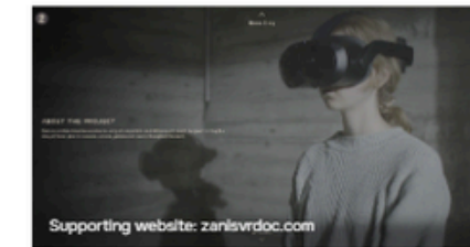
Supporting website: zanisvrdoc.com

"I GOT VERY EMOTIONAL, BECAUSE I COULD SENSE WHAT A PERSON MUST HAVE BEEN FEELING IN THAT SITUATION."